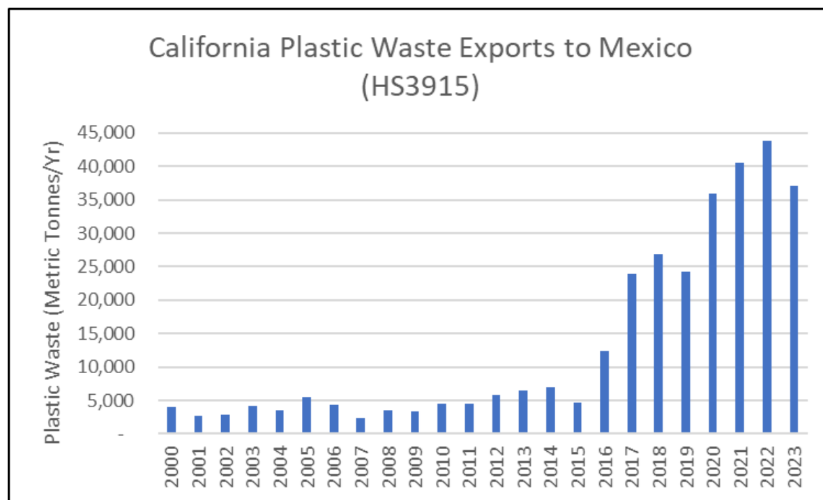
Figure 1: California Plastic Waste Exports to Mexico (All Types - HS3915) 60

Mechanical plastic recycling creates massive amounts of microplastics, volatile organic carbon emissions, and hazardous waste which are not regulated or responsibly managed in Mexico, Turkey, and low economic Asian countries. 61,62,63 Fires at poorly regulated plastic recycling facilities in Mexico are common, as evidenced by the recent fire of massive PET plastic waste piles at a plastic recycler near Mexico City called Planta de reciclaje R.G.M. 64