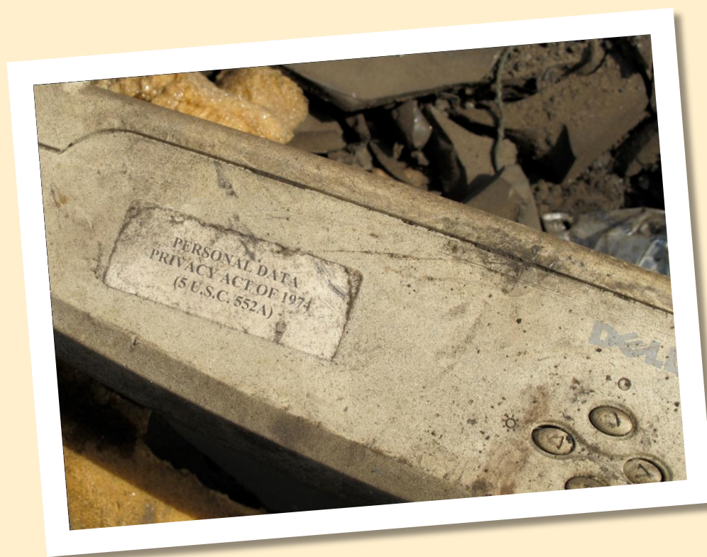
US Department of Defense, Privacy Act, Accra, Ghana.