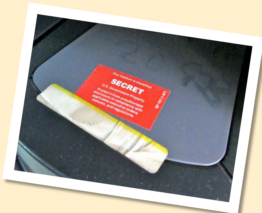
US Government Property, SECRET, Agency Unknown, Accra, Ghana