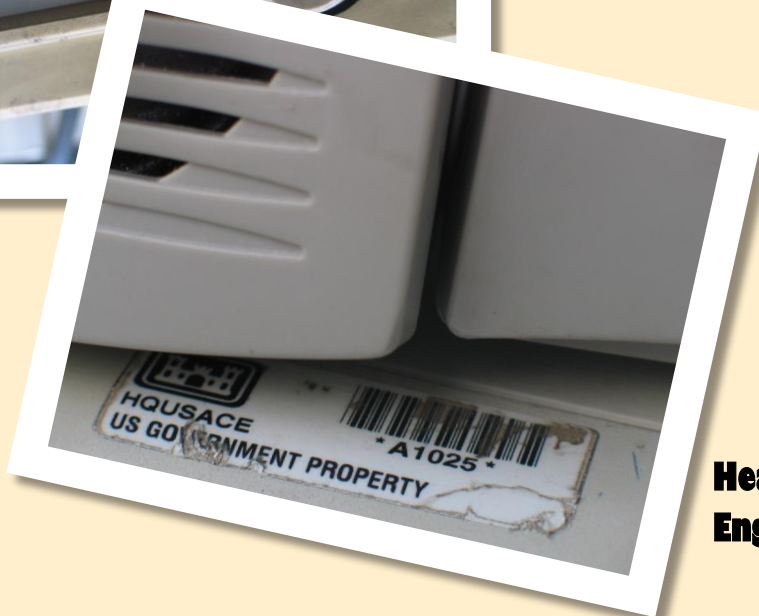
Headquarters US Army Corps of Engineers, Lagos, Nigeria.