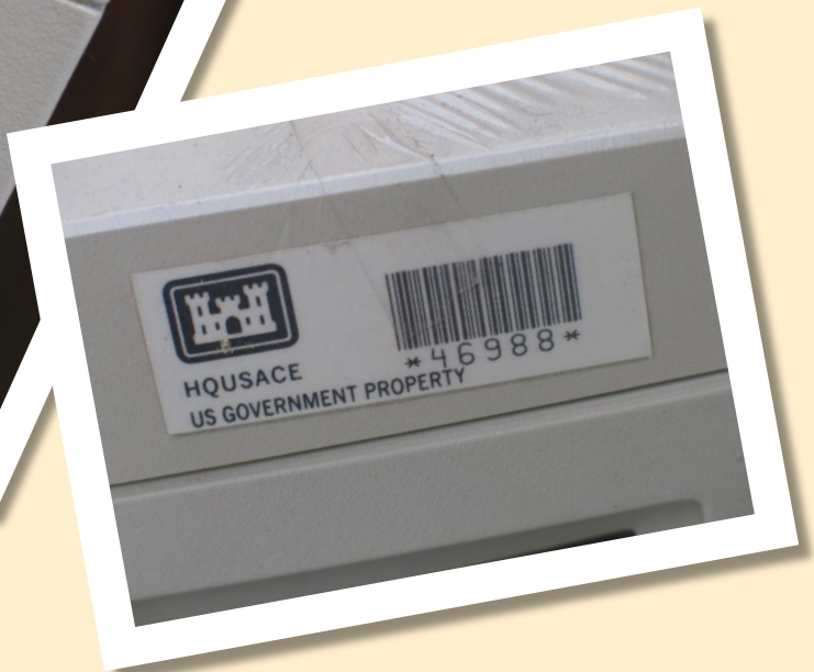
Headquarters US Army Corps of Engineers, Lagos, Nigeria