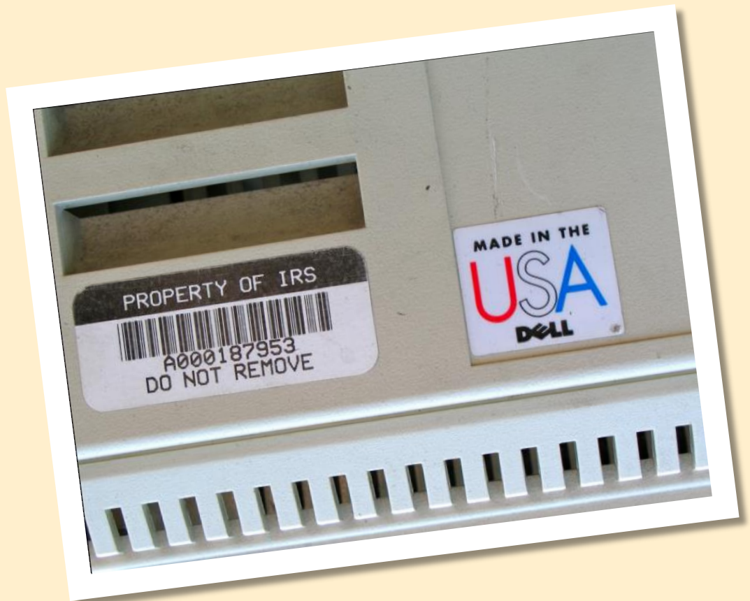
US Internal Revenue Service, Taizhou, China