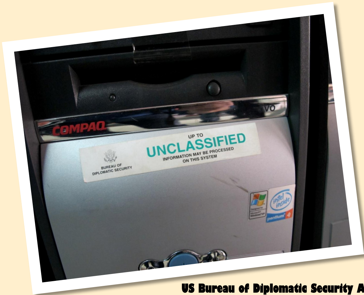
US Bureau of Diplomatic Security Accra, Ghana