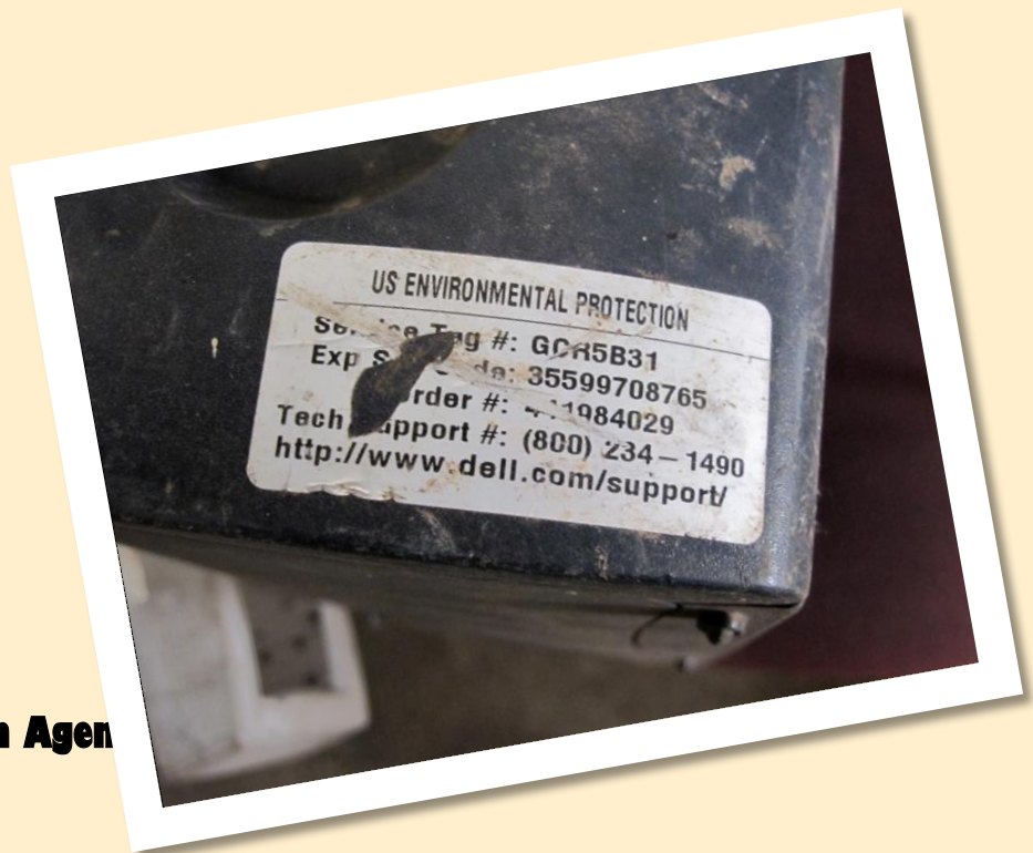
US Environmental Protection Agency Accra, Ghana