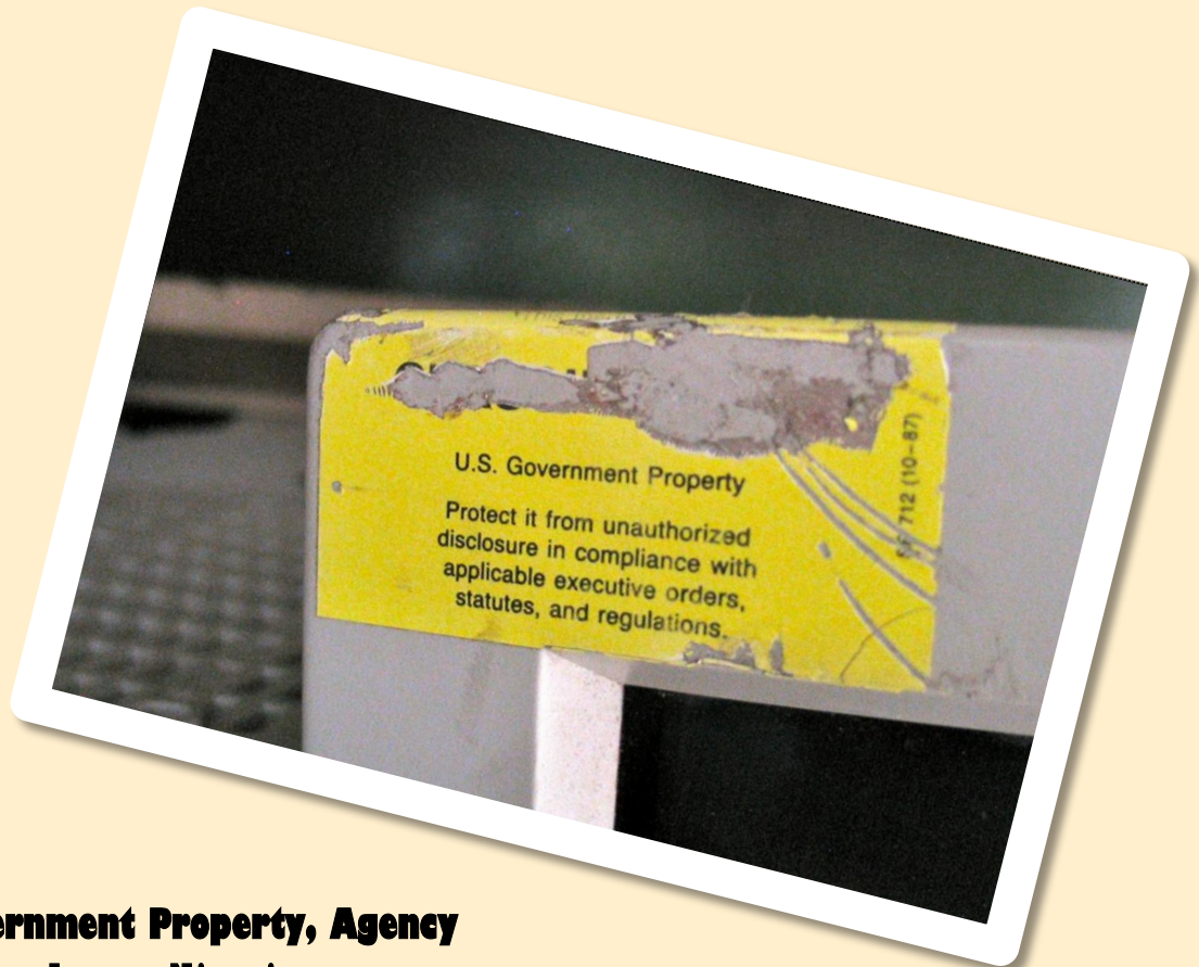
US Government Property, Agency Unknown, Lagos, Nigeria.