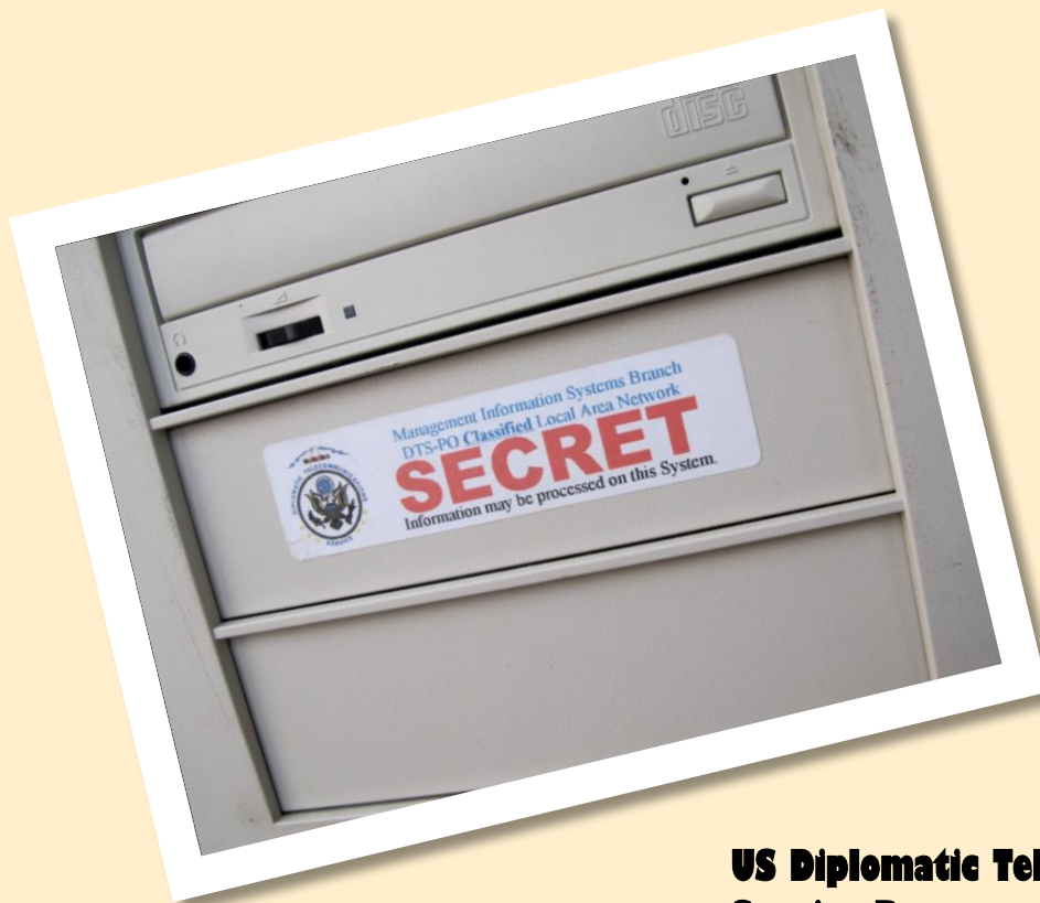
US Diplomatic Telecommunications Service Program Office, Accra, Ghana