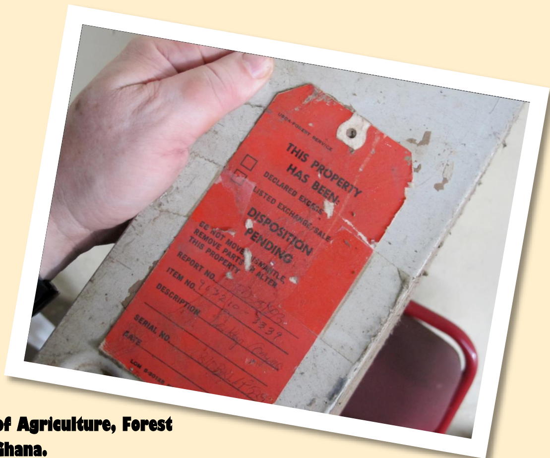
US Department of Agriculture, Forest Service, Accra, Ghana.