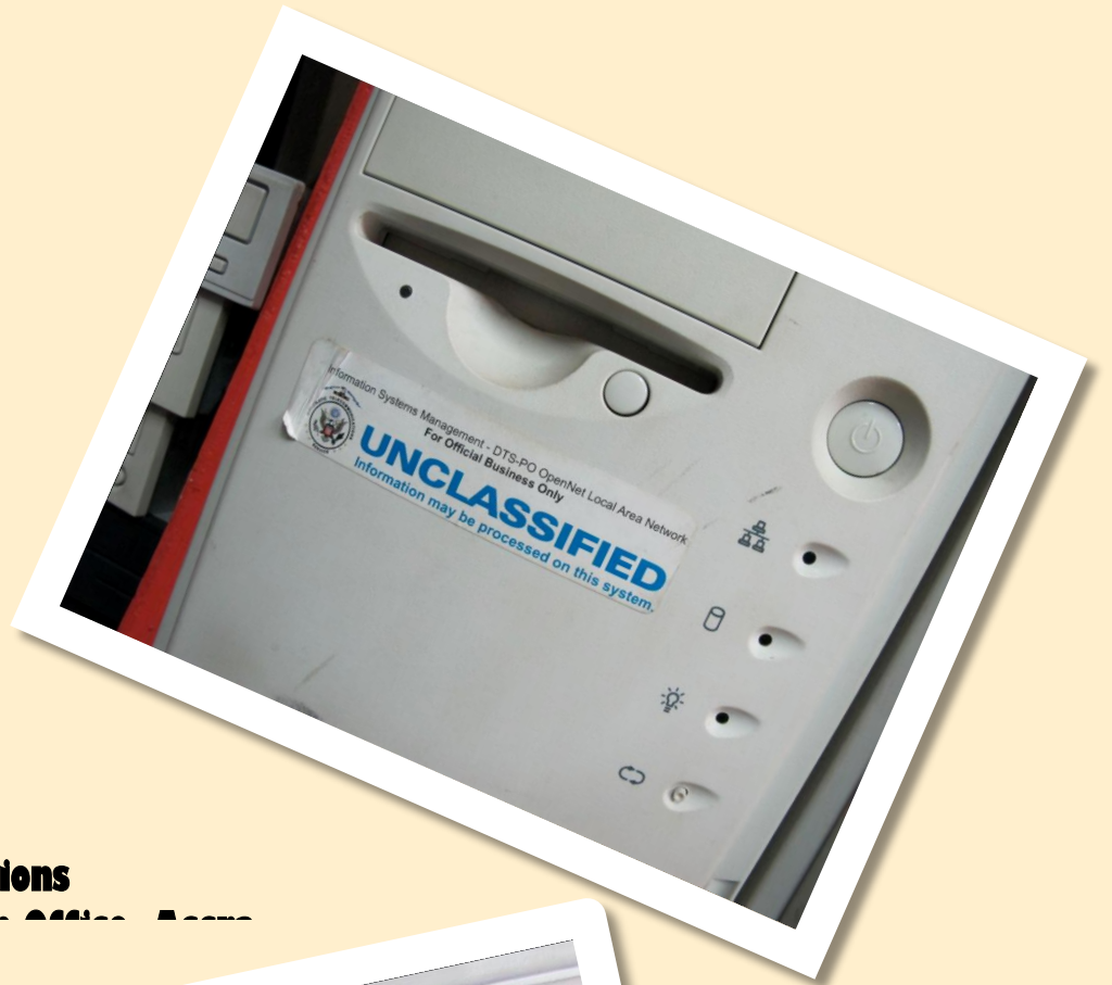
US Diplomatic Telecommunications Service Program Office, Accra