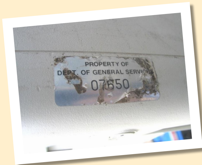
US Government Property, Agency unknown. Lagos, Nigeria