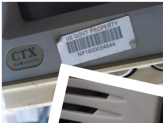
US Government Property, Agency Unknown, Lagos, Nigeria.