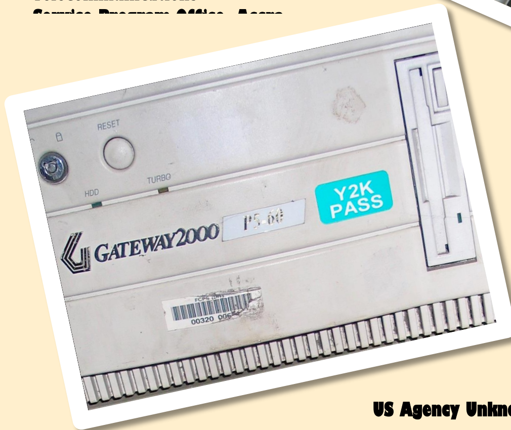
US Agency Unknown, Accra, Ghana