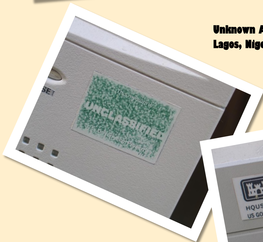
Unknown Agency, Lagos, Nigeria